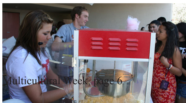
Multicultural Week, page 6

Huskies in the Hall: Do you think READ period is necessary?, page 7