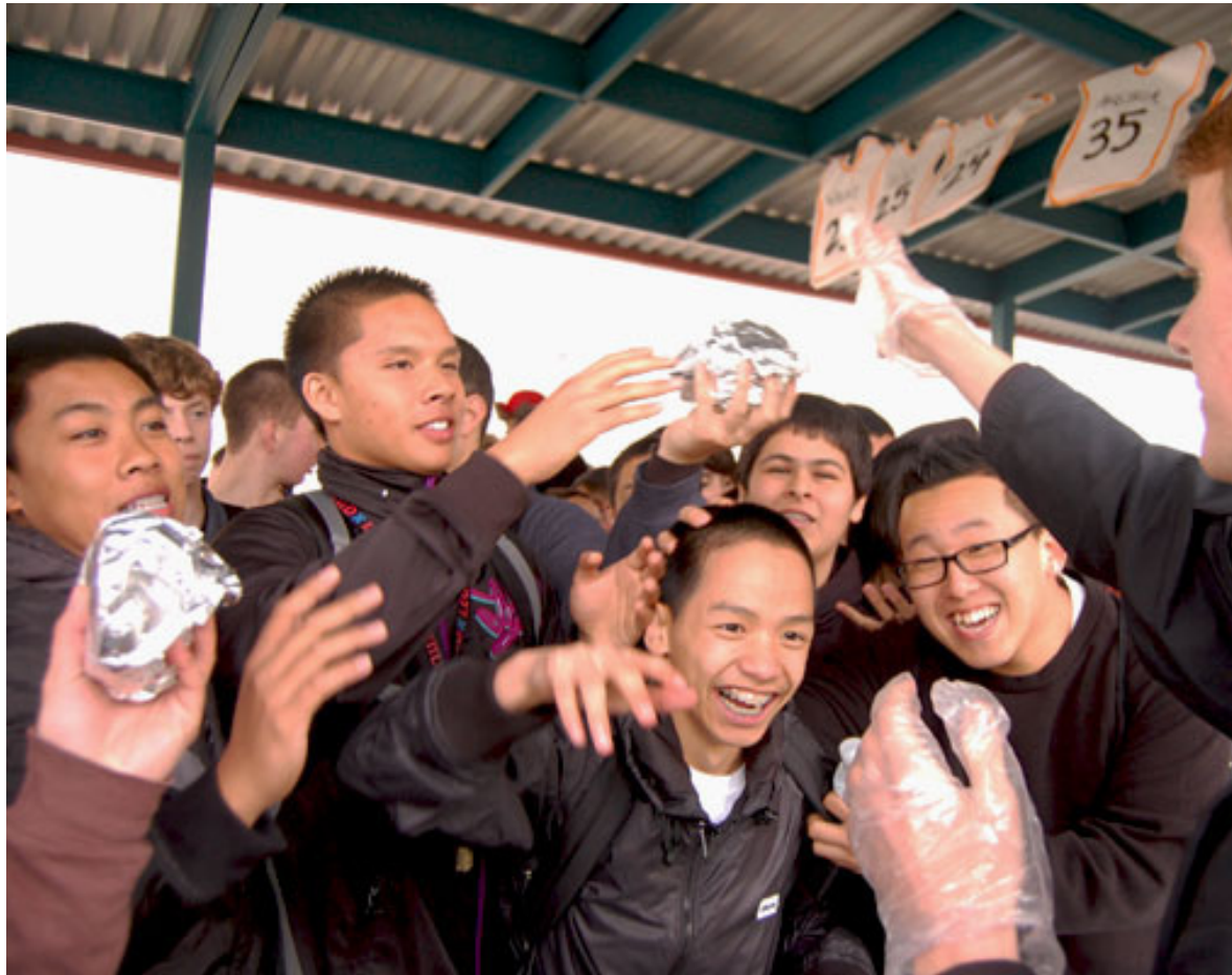
Students claw for hamburgers at the lunch rally Feb. 23. ASB basketball athletes who made North Coast Section (NCS) finals.